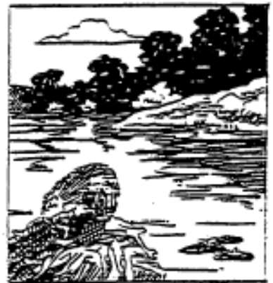
LAKE / POND