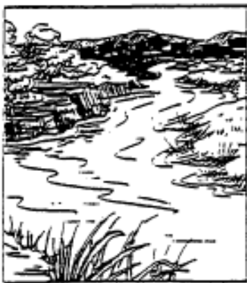
RIVER / STREAM